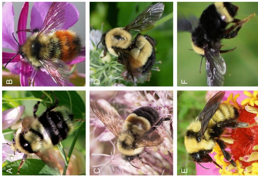
Harnessing Computer Vision to distinguish between pollinator species